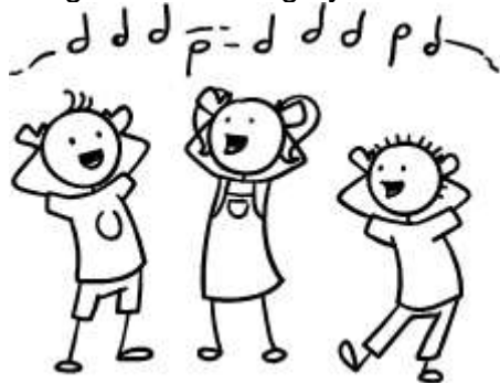
Lyrics for "Old MacDonald"

Either stick the flashcards in the order of the song on the board or use the Old MacDonald song poster. First, practice the gestures (below) for the farmer and the animals. Then play the song and encourage your students to sing along with you as they do the actions.